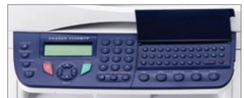
The Phaser 3100MFP/X features a full keyboard

Consumables for the Phaser 3100MFP are part of the Xerox Green World Alliance Supplies Recycling Program. For more information, please visit the Green World Alliance website at www.xerox.com/gwa